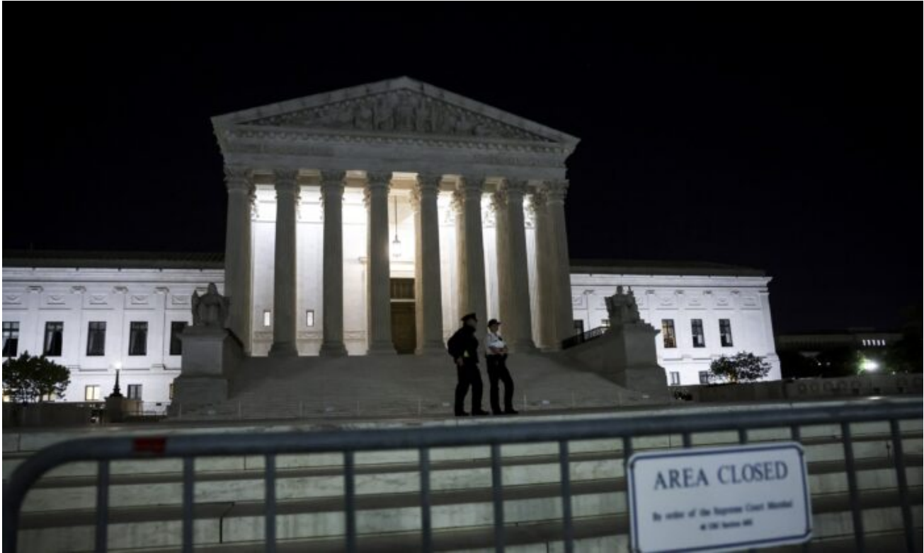
Fencing surrounds the Supreme Court in Washington on May 2, 2022.