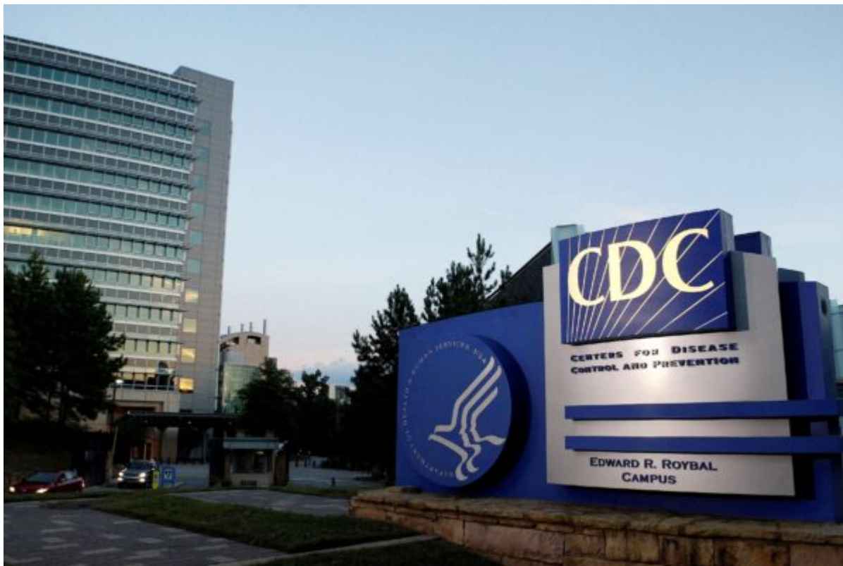
A general view of the Centers for Disease Control and Prevention (CDC) headquarters in Atlanta on Sept. 30, 2014.