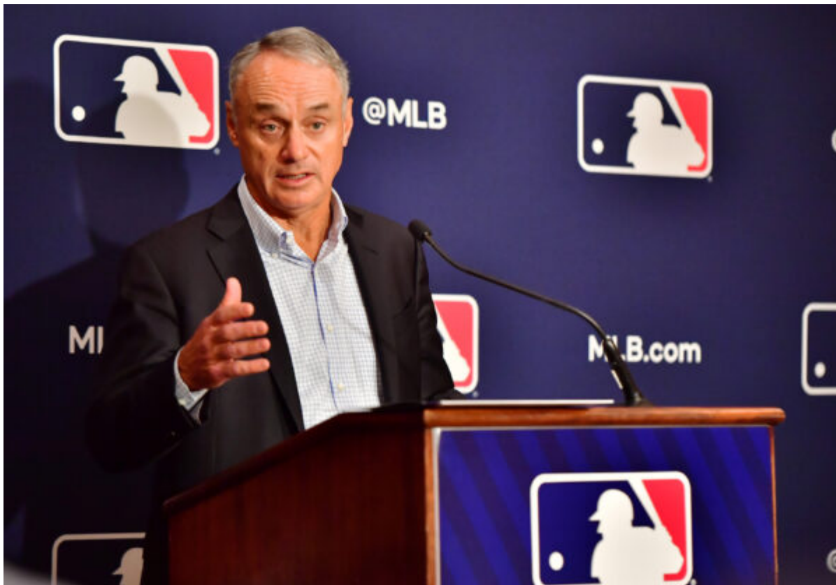
Major League Baseball Commissioner Rob Manfred answers questions during an MLB owner's meeting at the Waldorf Astoria, in Orlando, Fla., on Feb. 10, 2022.