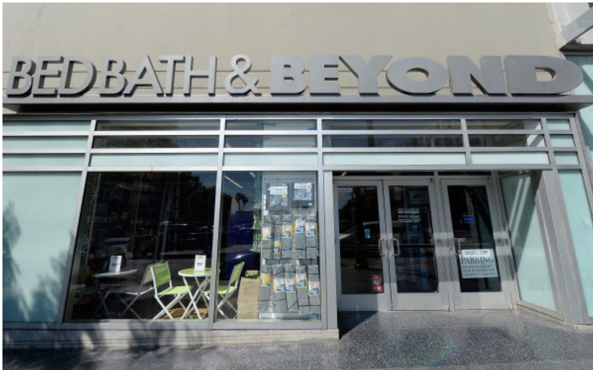
Bed Bath & Beyond store in Los Angeles, on April 10, 2013.

Here are 10 key institutions that have been successfully infiltrated by information-shapers: